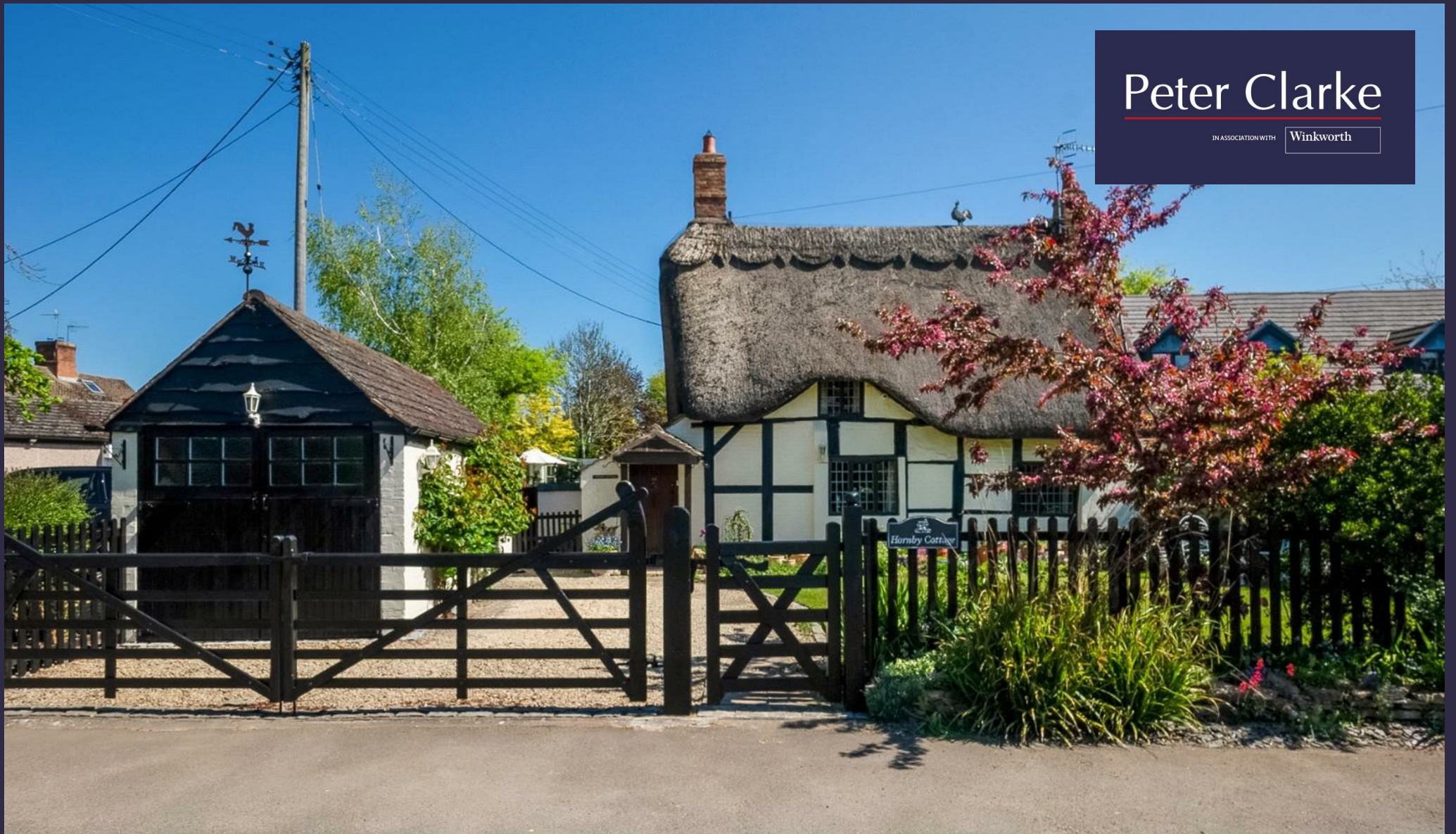
Hornby Cottage, High Street, Welford on Avon, Warwickshire, CV37 8EF